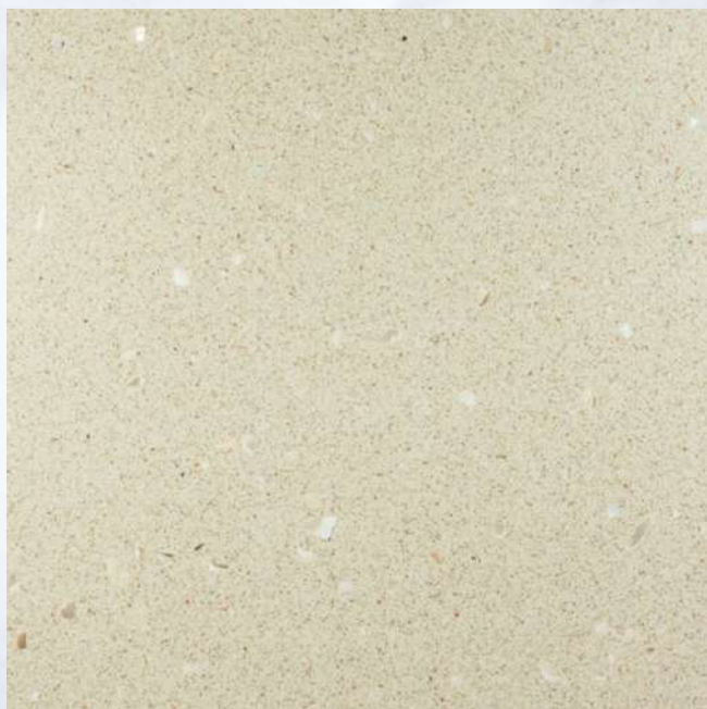
PERLA DI SABBIA